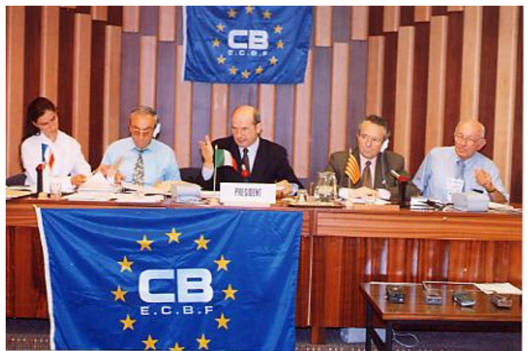
ECBF Congress at ITU in Geneva